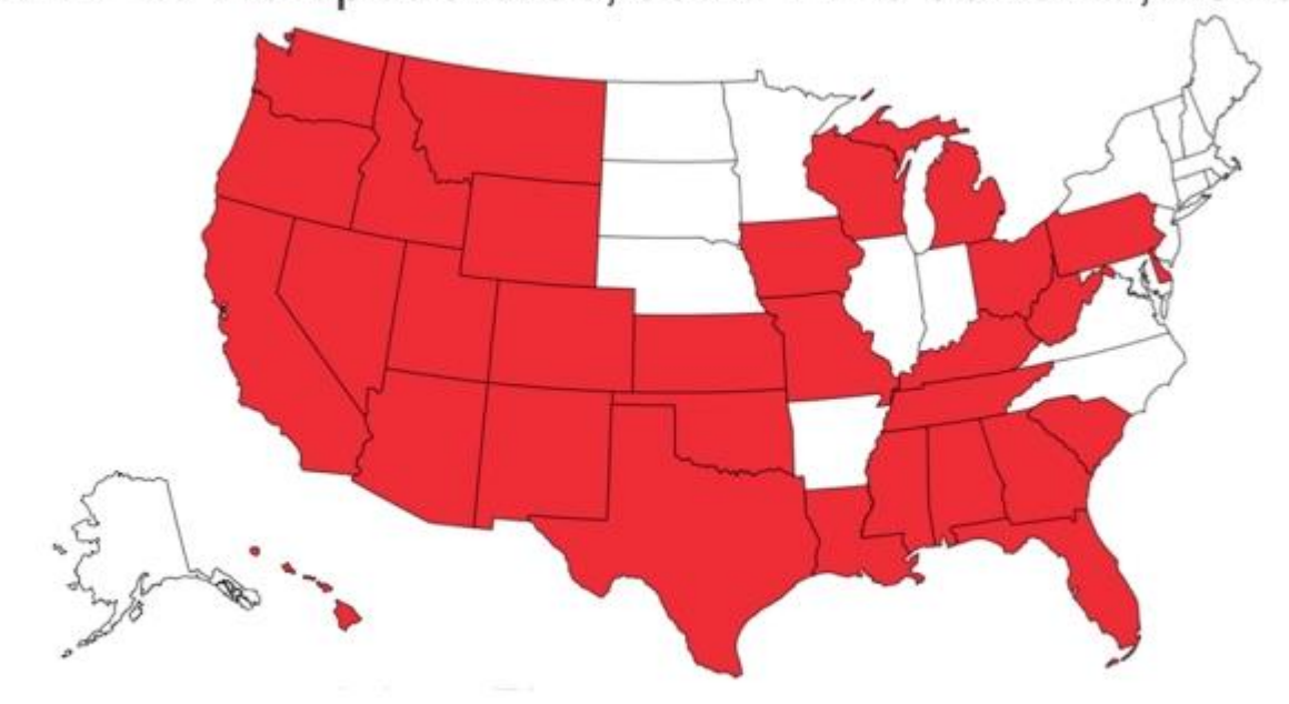
COVID-19 Hotspot States, June 14 to June 28, 2020